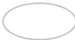
Trace the oval