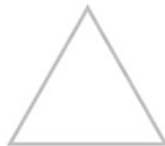
Trace the triangle