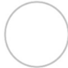
Trace the circle